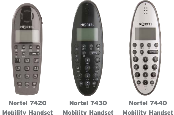
Nortel 7420 Mobility Handset

The Nortel Digital Mobility Deployment Tool makes quick work of getting accurate readings of wireless coverage, so